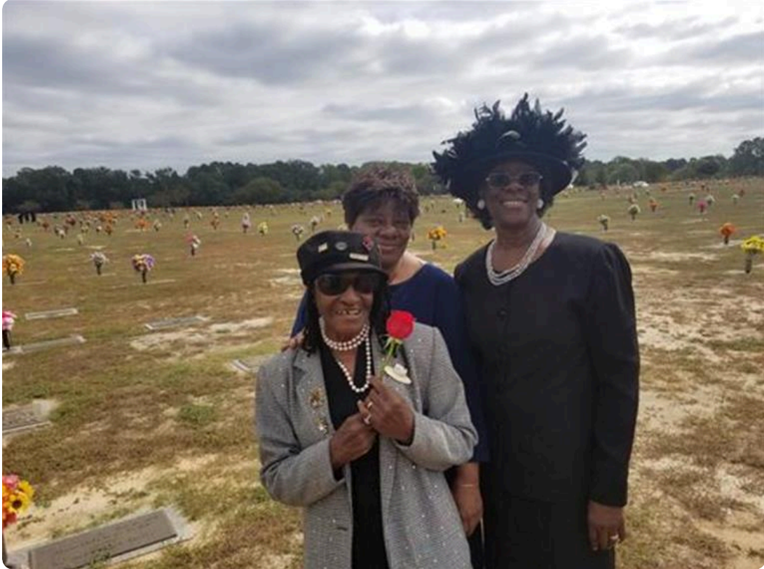
Ain't nothing like family! #Alstons